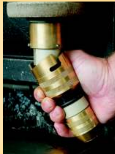
Quick-change torch of the PerCut series