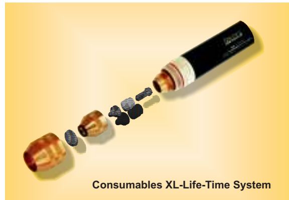
Consumables XL-Life-Time System

This unique plasma cutting system with HiFocus PLUS