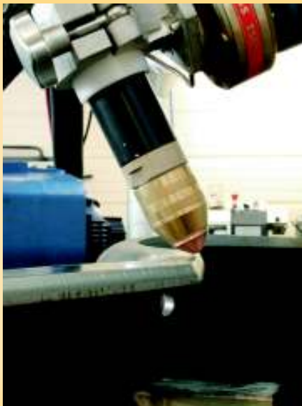
Bevel cutting on a 3-D workpiece with robot

technology will be offered in this performance class for the plasma gases oxygen, nitrogen and air. Because of the outstanding price-performance ratio especially the medium sized industry now is in the position to compete on the market with high-class cutting work.